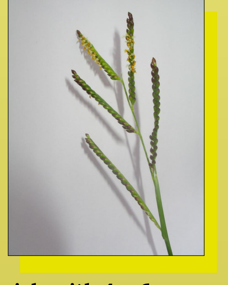
Panicle with 4 o 6 racemes that present cream-white stigmas at anthesis

Livestock producers who benefit from cv. Mulato II range from large livestock producers in LAC to smallholders in Asia who grow Mulato II to produce high quality forage to feed livestock. Additional economic benefits to smallholders are derived from artisanal seed production of cv. Mulato II as shown in Bolivia and Thailand.